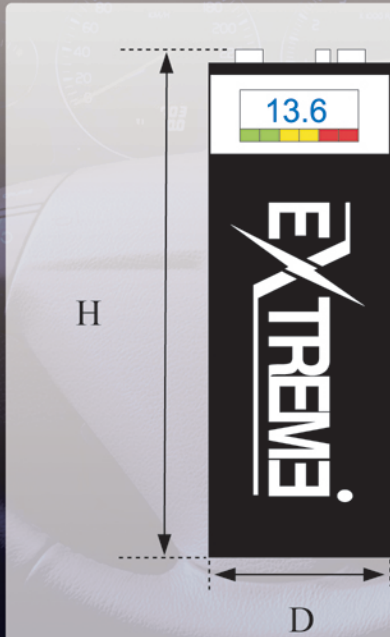
EXTC - Series